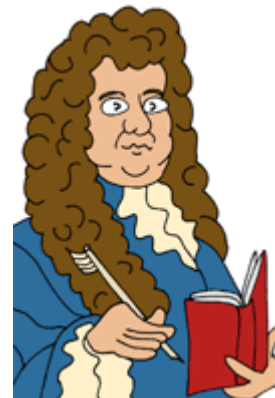
Samuel Pepys wrote about the fire in his diaries