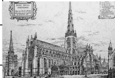
Before the fire