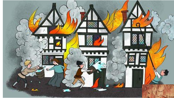
A fire started on September 2 nd 1666 in the King's bakery in Pudding Lane near London Bridge