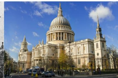
After the fire