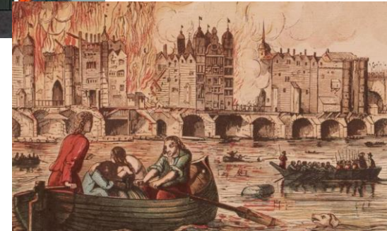
St Paul's Cathedral was burnt down in fire and was rebuilt