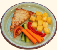
(v) Cheese & Tomato Pizza Wedge (G.D)