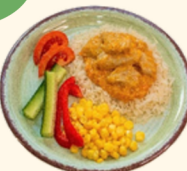
(h) Mild Chicken Curry