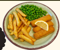
Fish Fillet Fingers (F.G)