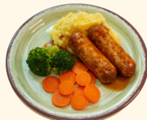
(v) Plant Power Sausages (D)