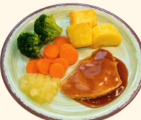
Roast Pork, Apple Sauce