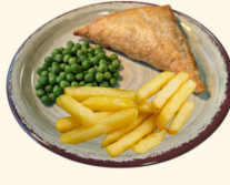
(v)(h) Cheese & Baked Bean Pasty (G.D)