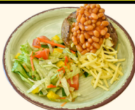
(v) Cheese/Beans (D)