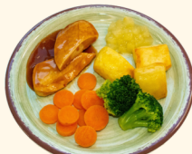
(vg) Quorn Roast, Apple Sauce (G)