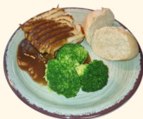
(v)(h) Vegetable Cottage Pie (G.D.SB)