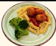
Park Meatballs in Tomato Sauce (G)