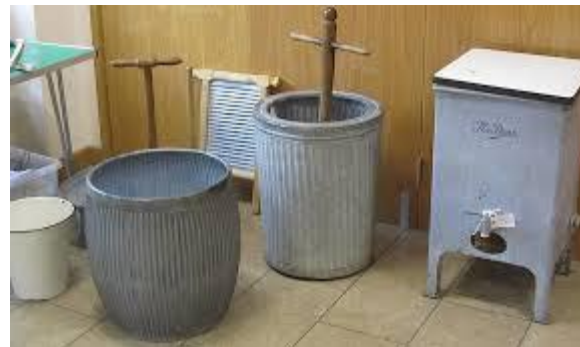
Dolly tub and washboard

Broad street pump In the Autumn of 1854, 500 people died in just 10 days in the centre of London in the worst of a series of cholera outbreaks.