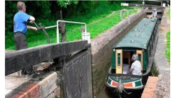
Canal boat through the lock

John Snow couldn't convince other doctors and scientists that cholera, a deadly disease, was spread when people drank contaminated water